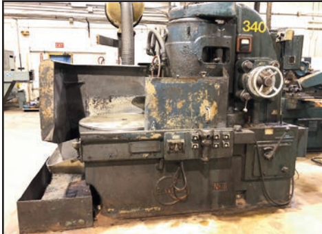
BLANCHARD NO 18 ROTARY SURFACE GRINDER