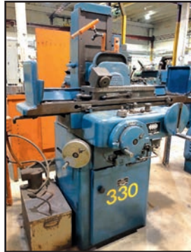
KO LEE 5618H SURFACE GRINDER