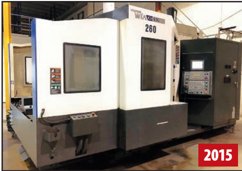
HYUNDAI WIA KH63G HORIZONTAL MACHINING CENTER

FACILITY CLOSURE – LEADING MFR. OF NEW PARTS FOR ENGINES & COMPRESSORS