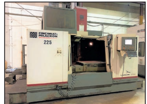
CINCINNATI MILACRON LANCER 1250 VERTICAL MACHINING CENTER