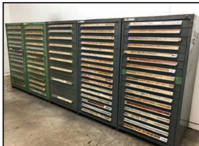
VIDMAR BALL BEARING TOOL CABINETS