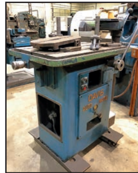
DAVIS 15 KEYSEATER